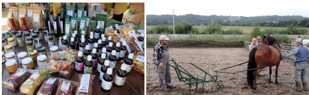
Figure 6: Products of Korenika and work on the farm