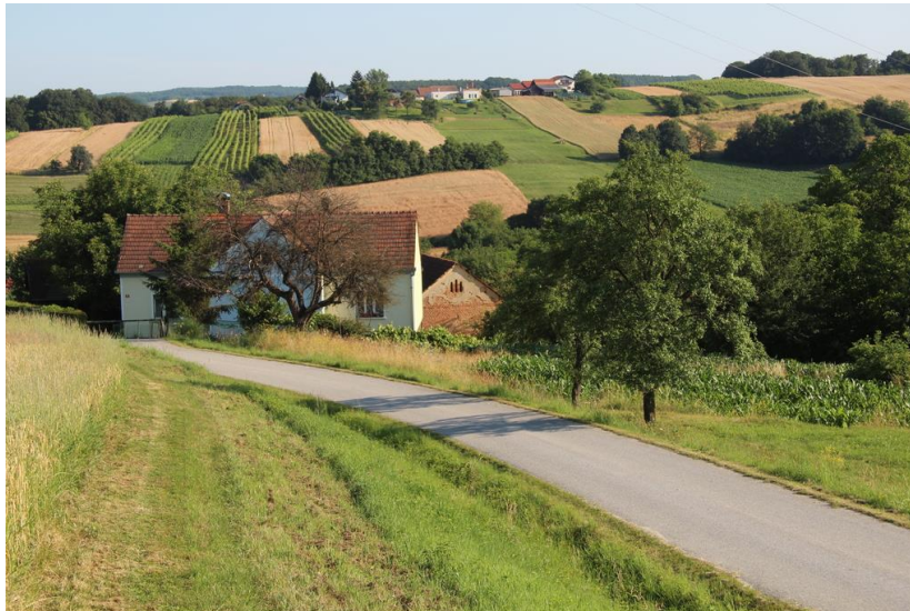
Figure 3: Typical landscape of Goričko

Goričko is known for its typical continental climate with characteristic dry and cold winters and very hot summers (KGZS, 2007). In the structure of utilised agricultural areas of the Landscape park Goričko, arable land prevails (about 50%), followed by grassland and meadows (above 25%) and orchards (10%). Farm size is below the national average (6.6 ha UAA/AH). The last decade saw considerable structural changes, however, with individual farmers enlarging their properties. The largest farm manages about 500 ha, located mainly in the central and eastern part of Goričko.