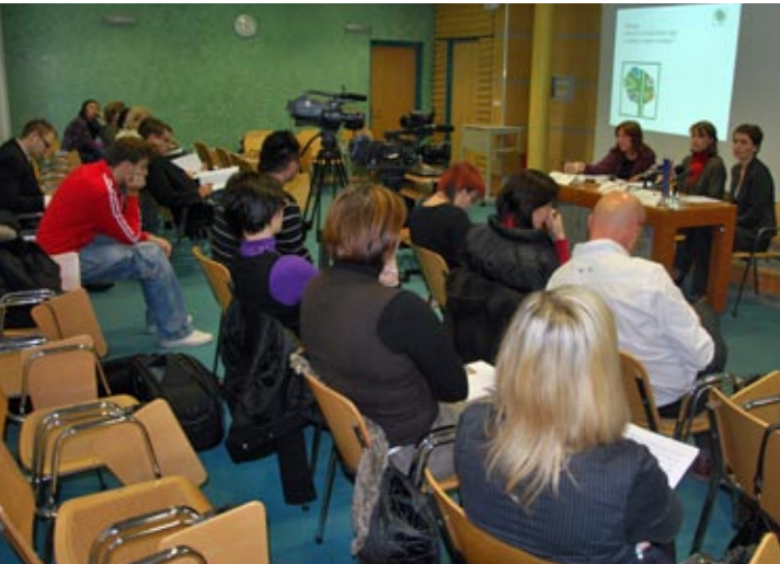
Participants at the press conference